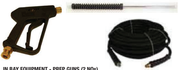
IN BAY EQUIPMENT - PREP GUNS (2 NOs)