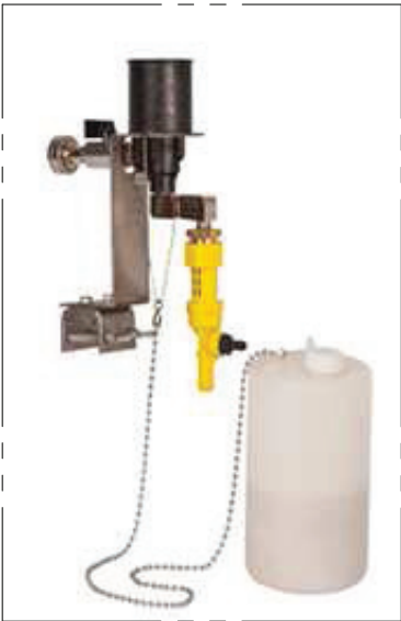
ADD ON EQUIPMENT - HYDROMINDER