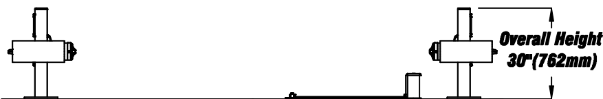
FRONT VIEW ELIMINATOR RW-103 (SHOWN WITH TREADLE)