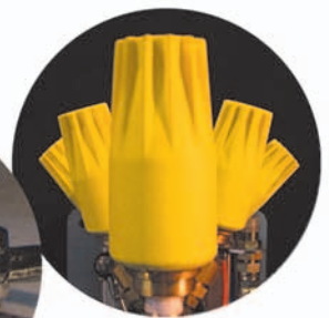
Unique MacNeil ball swivels for infinite nozzle adjustment