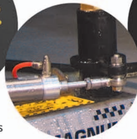
Pivoting action for increased dwell time