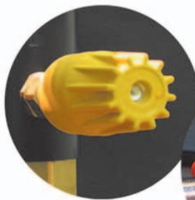
6 high-pressure rotary turbo nozzles